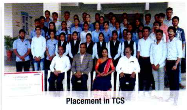
Placement in TCS