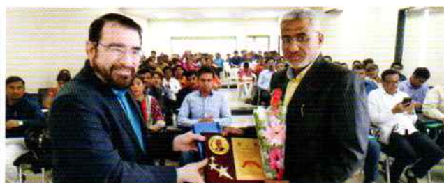
National Level Conference