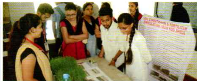
Poster &amp; Model Presentation