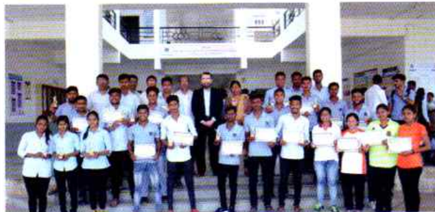
Achievements in Sports