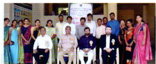
State Level Workshop