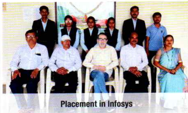
Placement in Infosys