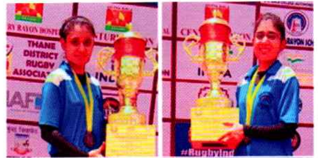
International Rugby Trophy winner