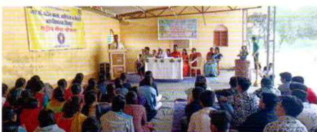
NSS Winter Camp