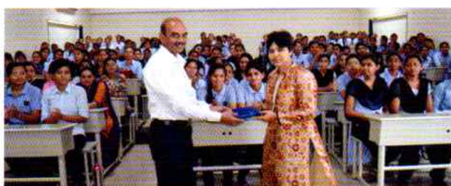
Training Program for Girls