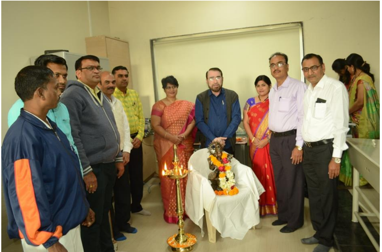
Photo(s) of Expert talk, Organized By Department Of Geography on Global Warming 2021