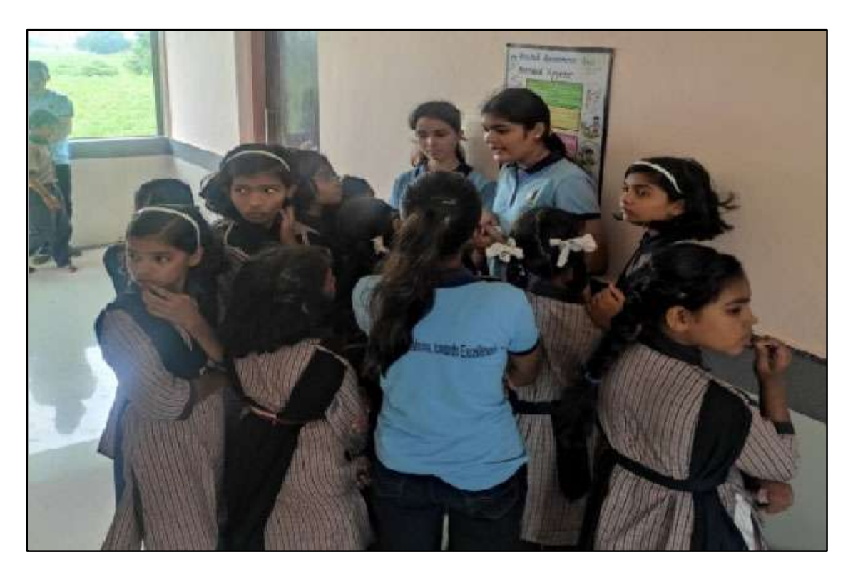
B. Sc. Students explaining about Hygiene awareness to young school students