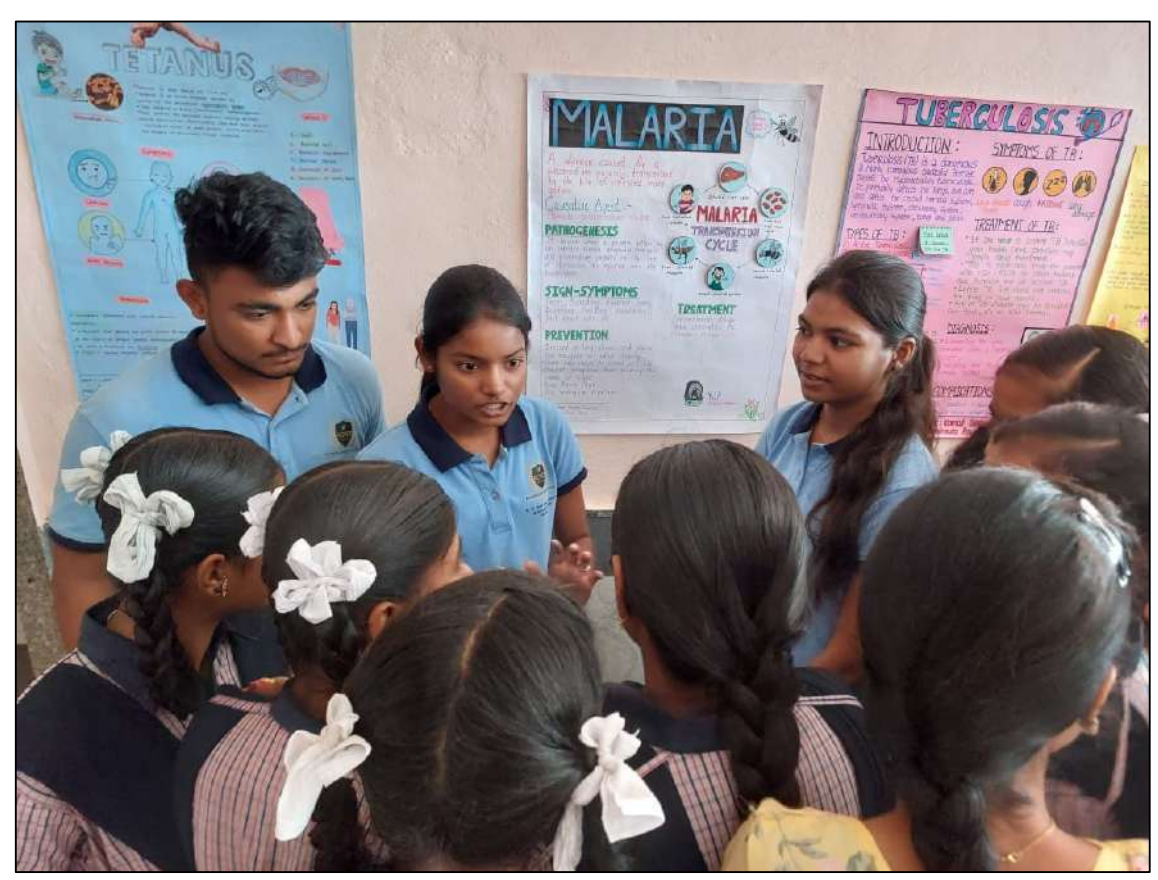
Students of B. Sc. spreading awareness through Poster Presentation