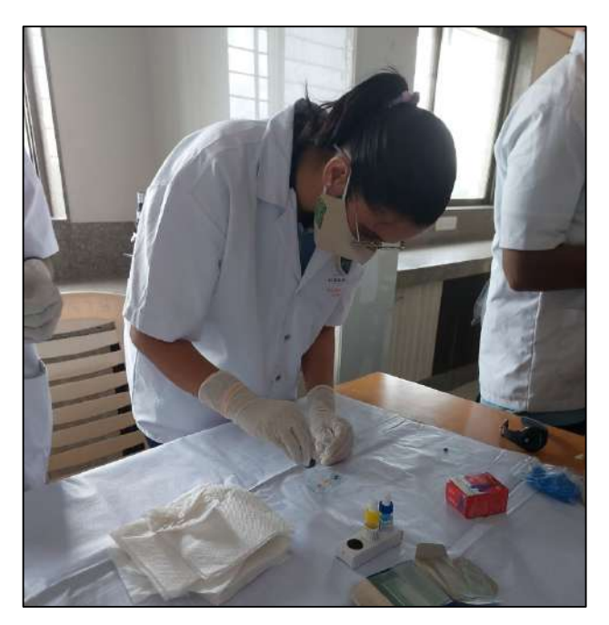
Examination of Slide