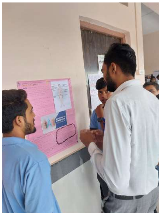
Hygiene awareness by Poster presentation