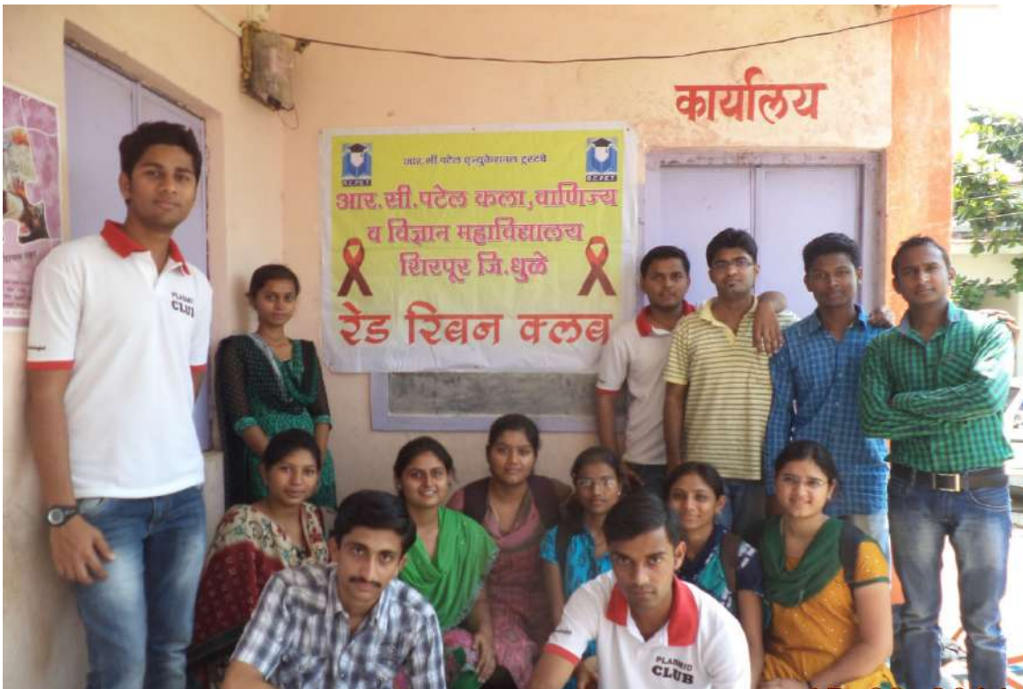
Students and Faculty members of Plasmid Club and Red Ribbon Club