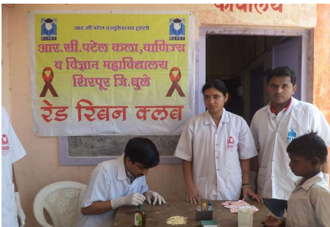
Students of M. Sc detecting Blood Group using standard protocol