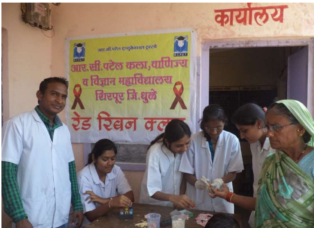
Students of M. Sc. pricking finger of an old lady for Blood Group detection