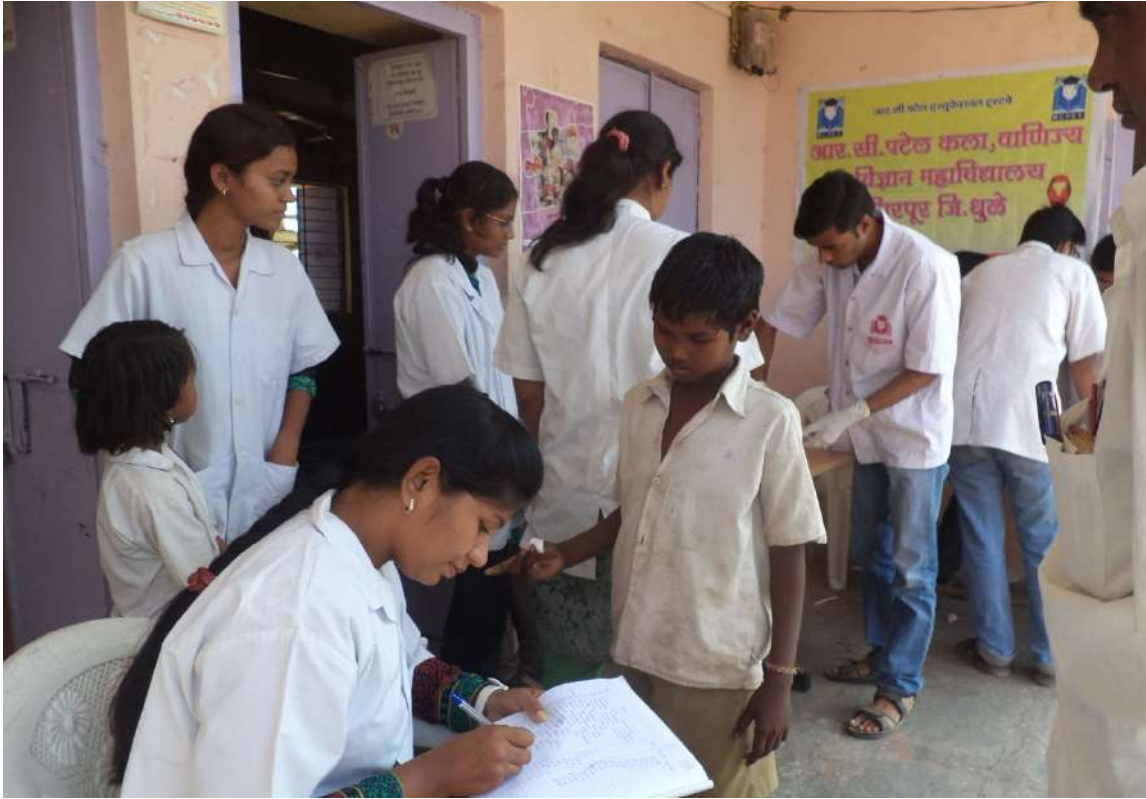
Systematic documentation of details