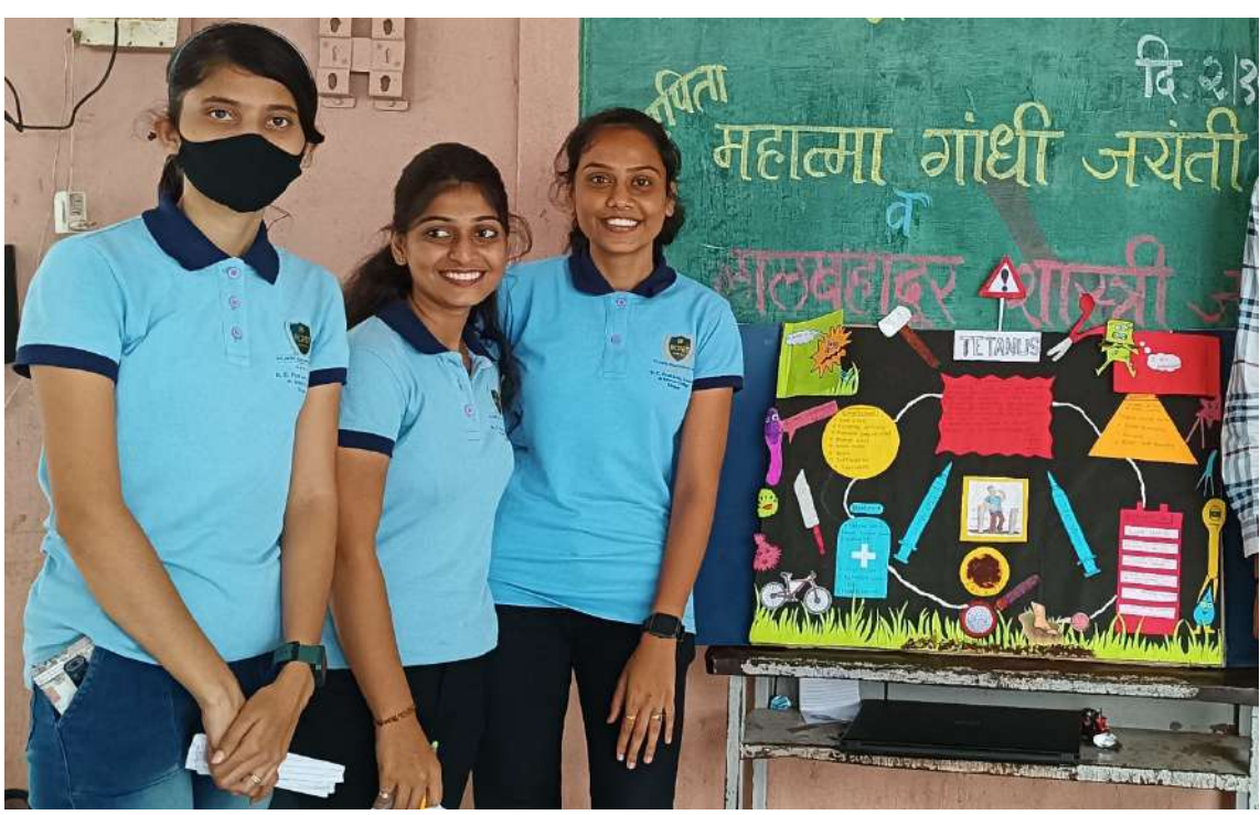
Poster presentation by the students of B. Sc.