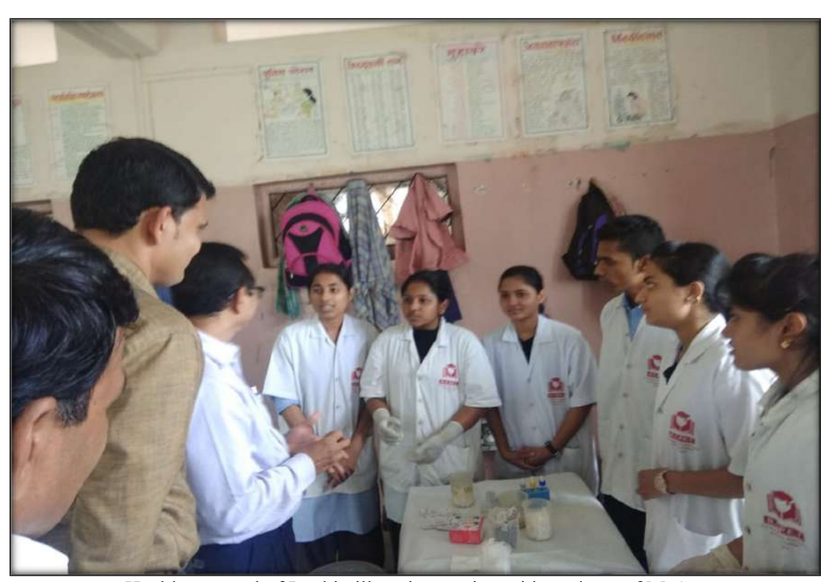
Health personal of Lauki village interacting with students of M. Sc.