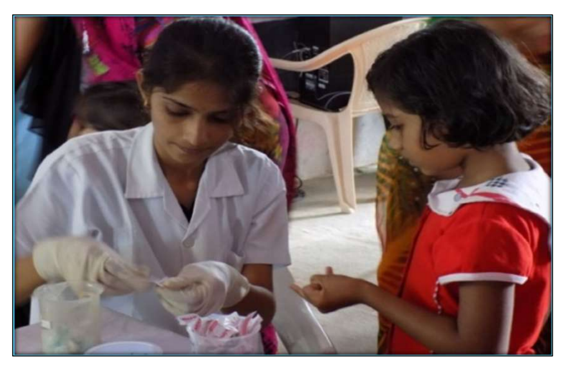
Student from M. Sc. pricking blood for Blood group detection