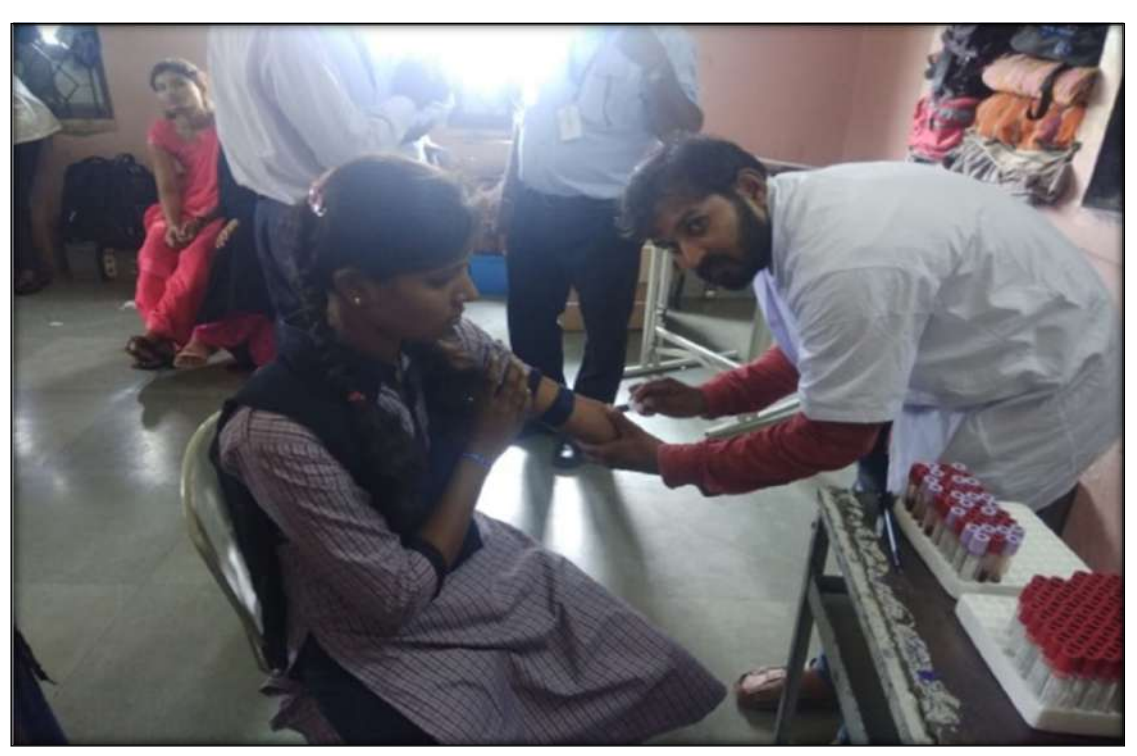
Student from M. Sc. pricking blood for pathological test